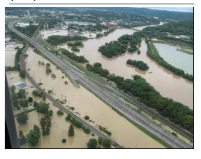
Figure 9.21-1. Tropical Storm Lee Flooding (2011) in the Town of Union

Broome County has a history of natural hazard events as detailed in Volume I, Section 5.0 of this plan. A summary of historical events is provided in each of the hazard profiles and includes a chronology of events that have affected the County and its municipalities. The Town of Union's history of federally-declared (as presented by FEMA) and significant hazard events (as presented in NOAA-NCEI) is consistent with that of Broome County. Table 9.21-2 provides details regarding municipal-specific loss and damages the town experienced during hazard events. Information provided in the table below is based on reference material or local sources. For details of these and additional events, refer to Volume I, Section 5.0 of this plan.