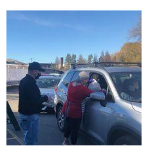
Volunteers distribute meals on Veterans' Day.