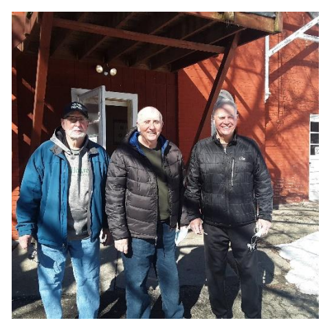
Meals on Wheels Volunteers