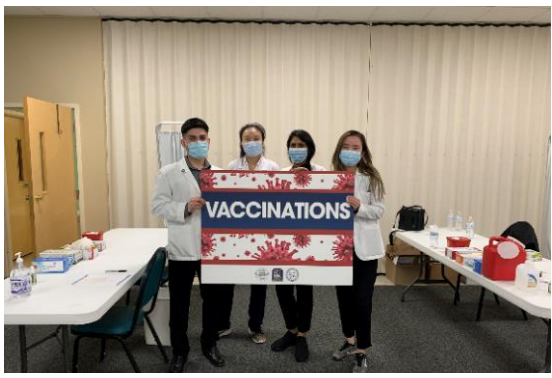
Binghamton University Students helped at the Rite-Aid Vaccine Clinic held at the Broome West Senior Center.

(OFA) continued to support Broome County's older adults by restarting many services and modifying our services to meet pandemic related needs. OFA continued to operate the vaccine line to help older adults access the vaccine and directed people to transportation options to get to vaccine appointments. Two COVID vaccine clinics were held at local senior centers. In June 2021, all Broome County senior centers opened to the public. Strict safety protocols were followed to assure that all guests and staff were kept safe at all the senior centers.