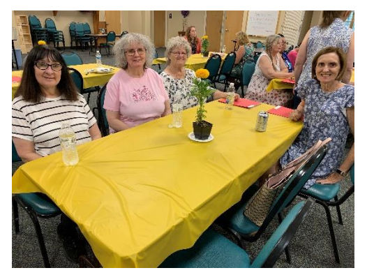
Foster Grandparent Volunteers enjoy their first in-person recognition event held at the Broome West Senior Center.

Foster Grandparent Program (FGP) –After more than a year of the program being on hold due to the pandemic, FGP resumed most operations in the fall of 2021. With some schools not allowing volunteers back, FGP was able to place 30 volunteers in 14 schools and Head Start programs. The program continued to support children with special needs and help older adults stay connected and engaged. 90% of students mentored by Foster Grandparents in grades K-6 showed improvements in literacy and/or math. 93% of Foster Grandparents reported an improvement in their overall quality of life.