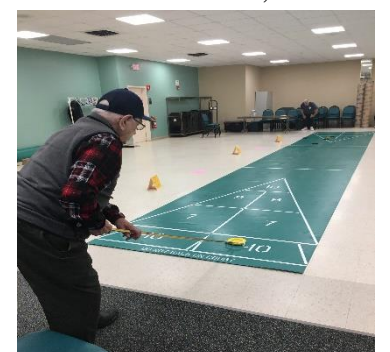
Activities including shuffleboard return to the senior centers.

Broome County Senior Centers & Congregate Meals Program – After being closed since the end of March 2020, all Broome County senior centers re-opened in June 2021. The senior centers